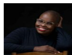
The Women Making Waves in Theatre in Africa Part 2 by The African Theatre Magazine