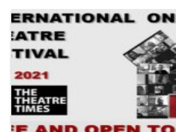
The Theatre Times Launches Third Edition of IOTF:... by The Theatre Times 19th May 2021