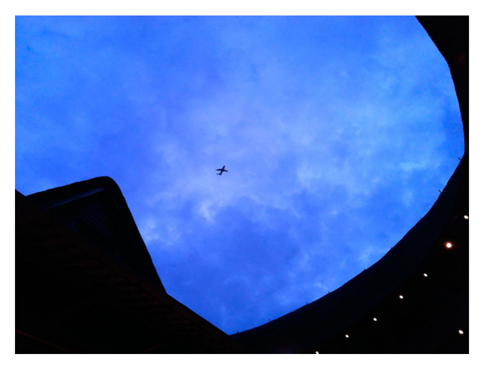
Figure 1. Global dream space. A four-engine jumbo jet airliner flying over the London Globe during a performance of A Midsummer Night's Dream (dir. Yang Jung-ung) by South Korea's Yohangza Company on 30 April 2012.

the dark side of the moon on Christmas Eve 1968 during the Apollo 8 mission. Earthrise, seen for the first time by human eyes in space, marked a pivotal moment in history. Whole earth photographs, including the renowned "blue marble" taken by Harrison Schmitt on the way to the moon aboard Apollo 17 in 1972, helped launch Earth Day and environmental movements and brought a renewed focus on the earth itself (Poole). The ripple effects of these events are still being felt in religion, culture, politics, and the arts. One of the Fundación Shakespeare Argentina's advertisements in 2013 featured a globe with the Droeshout and Janssen portraits of Shakespeare filling the boxes between lines of latitude and longitude. Humanity's ability to see the whole earth from different angles revitalized and complicated the totalizing concept of one world. While they do not explicitly evoke whole earth photographs as sources of inspiration, Mary Louise Pratt, Walter Mignolo, and Gayatri Chakravorty Spivak have used the astronomical metaphor of planetary consciousness to theorize alterity and human universals. Spivak, for example, envisions planetarity as a mode of displacing globalization (16, 97) that fosters "planetary subjects rather than global agents" (73).