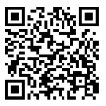
Figure 3. Scan this QR code with your smart phone to go directly to video clips related to the London Olympics and the Globe. Alternatively, search online for "Global Shakespeare MIT" and within the project for "Globe Theatre".

for the 2012 World Shakespeare Festival. The closing ceremony again echoed the "Isles of Wonder" theme (see Figure 3). Timothy Spall's Winston Churchill recited the same passage Branagh had spoken earlier. These quotations are taken out of context. The enchanted isle full of noises refers to the British Isles that are gearing up to welcome guests from afar. Caliban has been recruited to represent Britain's cultural others as well as the others within the greater London. Branagh's and Spall's use of Caliban's speech is a clever but ethically problematic repossession of a colonial narrative and figure. Multilingual and global Shakespeares represented a step toward consolidating the underdefined post-Imperial British identity and creating new international identities for touring companies from outside the UK.