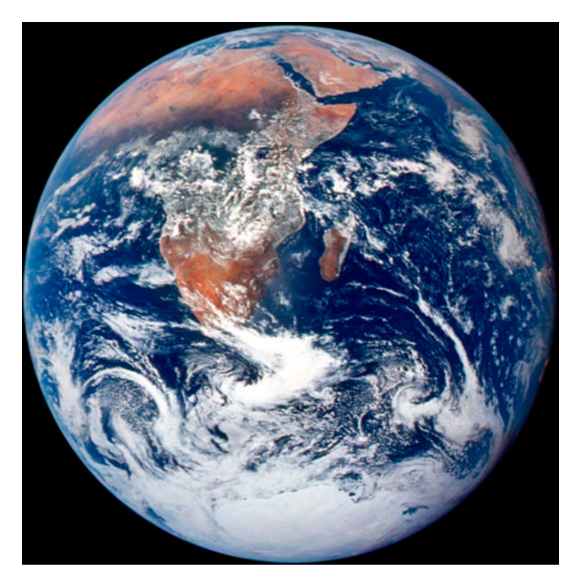
Figure 2. View of the earth as seen by the Apollo 17 crew travelling toward the moon on 7 December 1972. The photograph shows the Mediterranean Sea, the African continent, the Arabian Peninsula, the Malagasy Republic off the southeastern coast of Africa, the Asia mainland, and the south polar ice cap.

the earth looms large as tagline fades in: "The biggest celebration of Shakespeare starts now." These images are suggestive of an infinitely mobile Shakespeare in orbit, signifying across geographic spaces and capturing the human conditions on earth. These metaphors are of course problematic, because texts do not float above history, politics, and local difference. However, the topos of the globe continues to delight and fascinate. To mark the 400th anniversary of the death of William Shakespeare in 2016, the Shakespeare Theatre Association is launching an initiative to have performances, readings, and commentary on Shakespeare's legacy streamed live from every time zone and in different languages as the earth rotates.