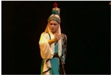
Wangzi fuchou ji (The Revenge of the Prince) Su, Leci 1994